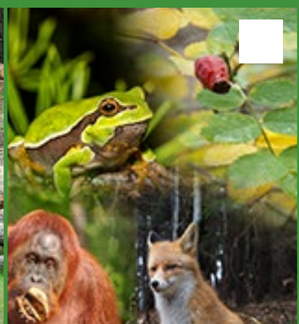
Extinction of species